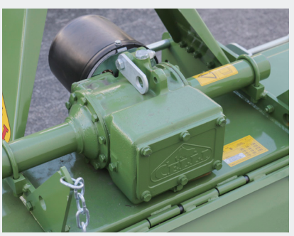
Heavy duty four speed gearbox