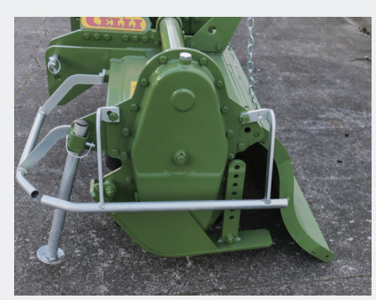
All gear side drive