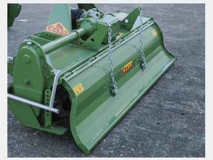
Rear scroll tailgate